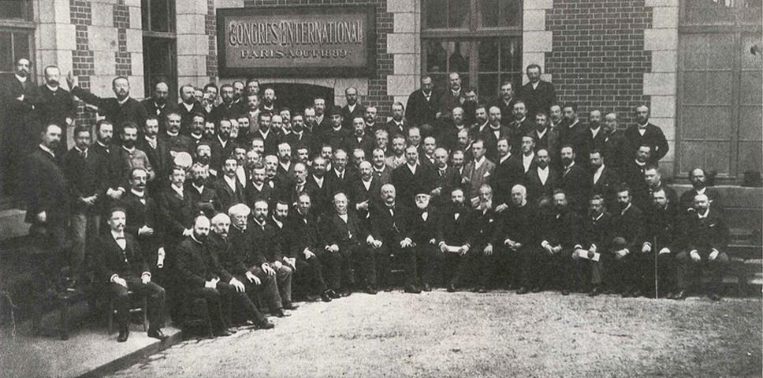
INTERNATIONAL CONGRESS OF DERMATOLOGY AND SYPHILOLOGY PARIS, AUGUST 1889